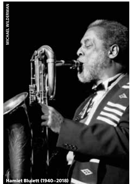
Hamiet Bluiett (1940–2018)

With his innovative approach to the baritone, Bluiett soon found work with Sam Rivers, Tito Puente and Babatunde Olatunji, and became a key player on New York's growing loft scene. In